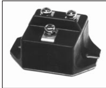
CS241020 Fast Recovery Single Diode Module 200 Amperes/1000 Volts